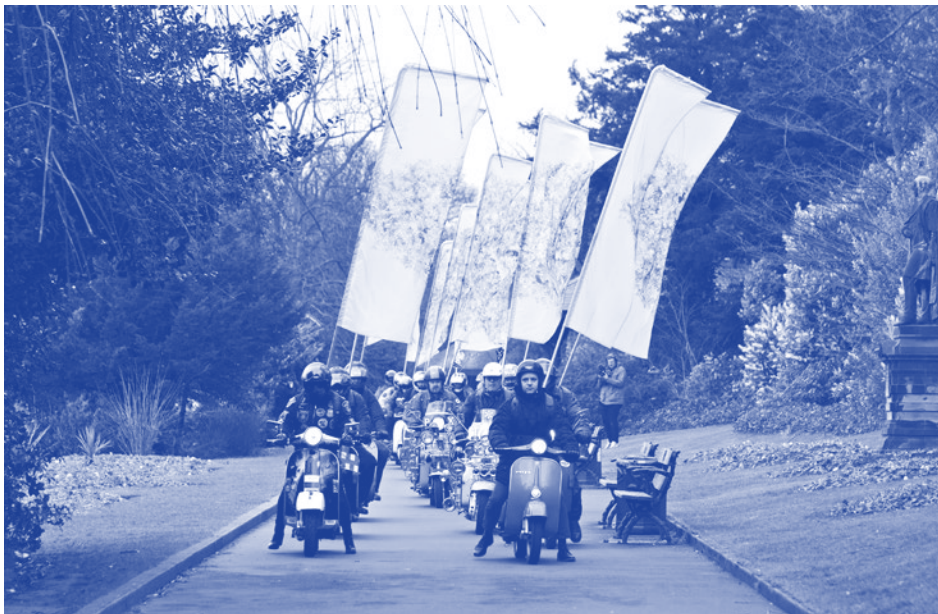
Richard William Wheater, Tree and Scooters , 2013. Acts of Making Festival 2015, Shipley Art Gallery.

Acts of Making is a two-week festival celebrating contemporary craft through performances, live installations and workshops. Events will be held at the Plymouth College of Art, Plymouth City Museum and Art Gallery and Mount Edgumbe House and Country Park, as well as more unusual spaces across town. We want you to contribute, collaborate and capture your discoveries.